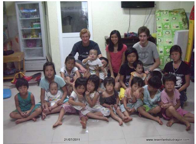
Orphanage: "Nhà Mẹ Côi Truyền Tin"

"We realize that what we accomplish is only a drop in the sea, but if this drop would not exist, it would be lacking" (Mother Teresa)